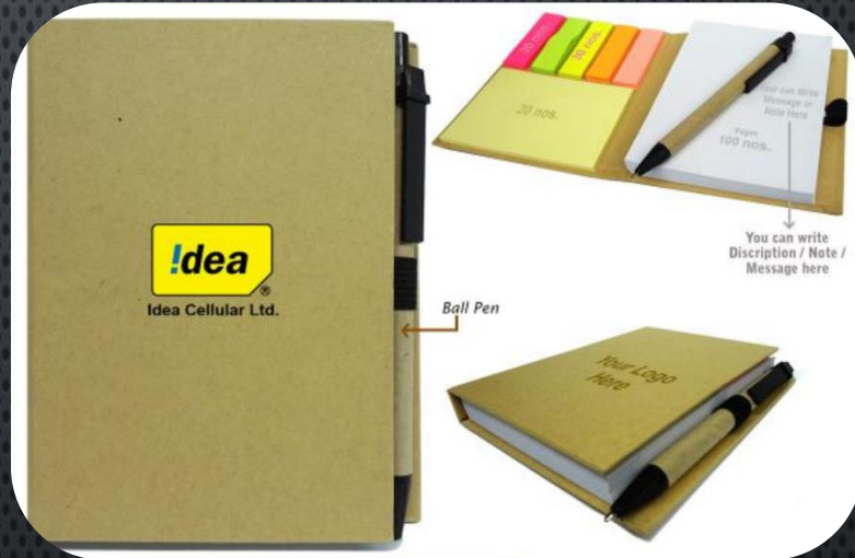
B 504 Eco Friendly Note Pad 14x10c.m