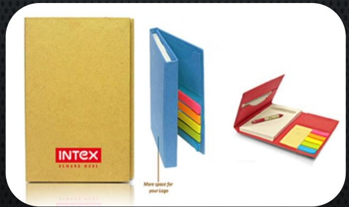
B 506 Eco Friendly Note Pad 11x16c.m