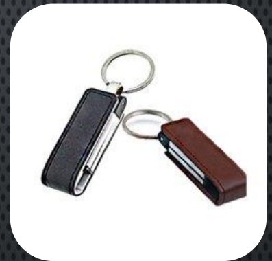
B 603 Leather Magnet Pen Drive