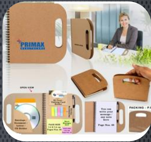
B 514 Multi Utility Folder 21x21 c.m