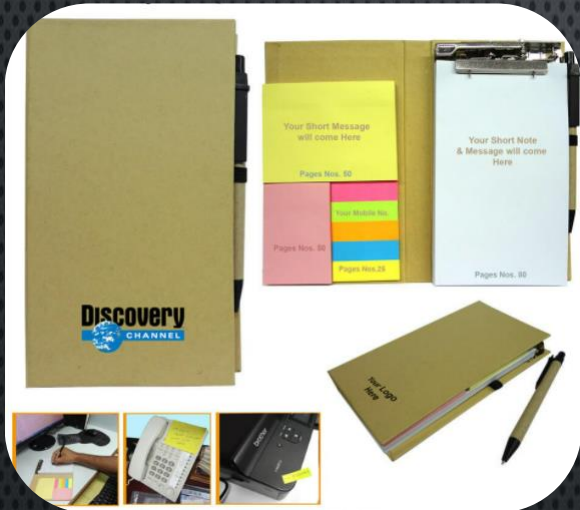
B 503 Eco Friendly Note Pad 20x11 c.m