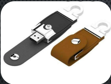
B 601 Leather Button Pen Drive