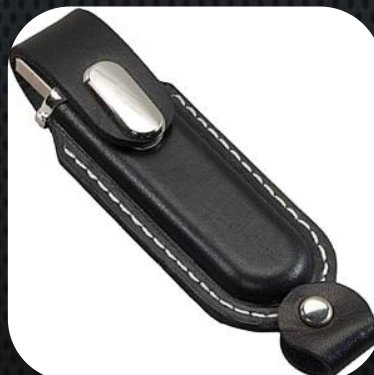
B 605 Leather Button Pen Drive