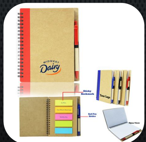
B 512 Eco Friendly Note Pad 18x13 c.m