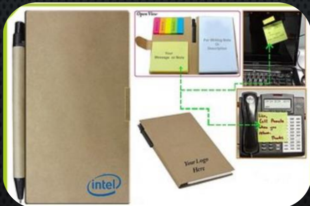
B 505 Eco Friendly Note Pad 15x8c.m