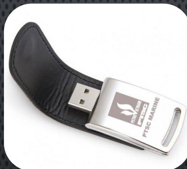
B 602 Leather Magnet Pen Drive