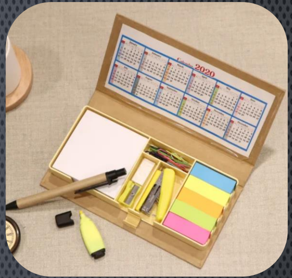
B 502 Eco Friendly Stationary set 20x10 c.m