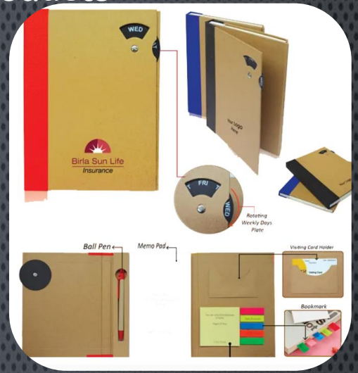
B 508 Eco Friendly Note Pad 21x16 c.m