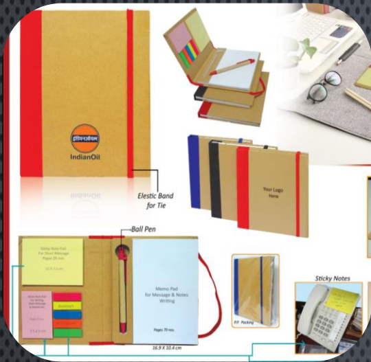
B 507 Eco Friendly Note Pad 18x14 c.m