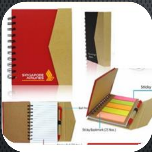
B 509 Eco Friendly Note Pad 16 x 12 c.m