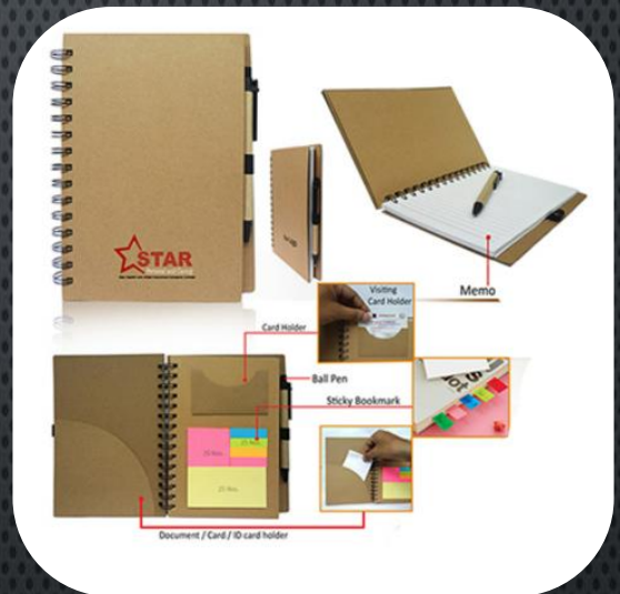
B 510 Eco Friendly Note Pad 21x15 c.m