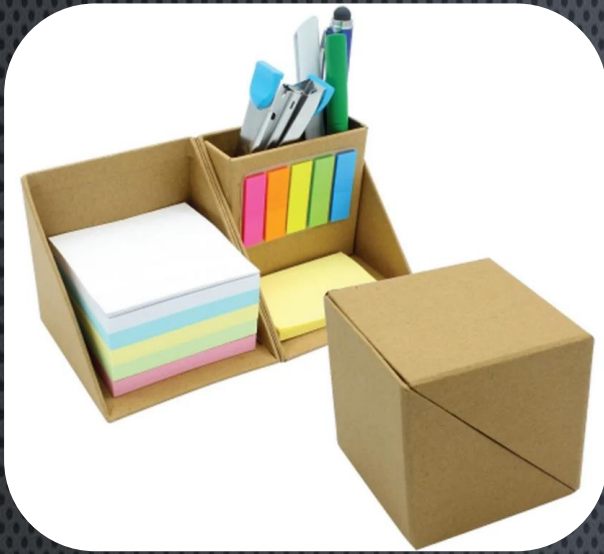
B 501 Desktop Cube Size 9x9x9 c.m