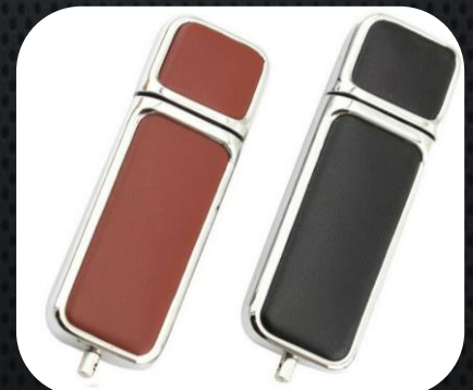
B 606 Leather Pen Drive