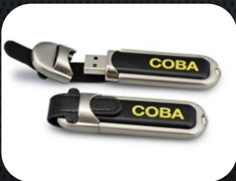
B 604 Leather Pen Drive