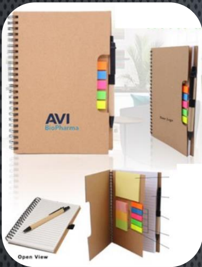
B 513 Sticky Note Pad 21x14 c.m